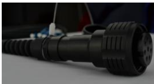
8Cores Plug (ZDC08P)