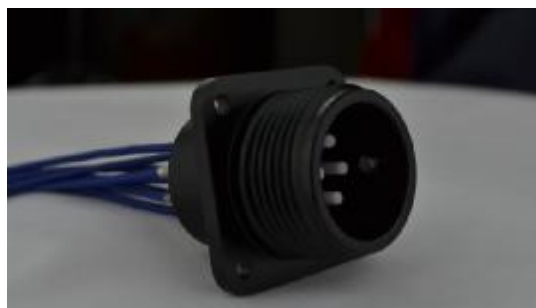
6Cores Socket (ZDC06S)