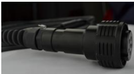
6Cores Plug (ZDC06P)