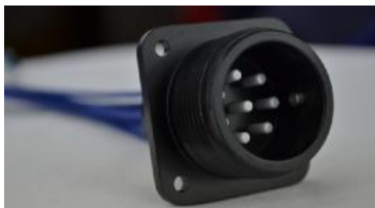
8Cores Socket (ZDC08S)