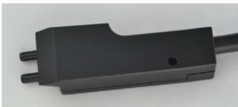
BACHMANN Shell Connector